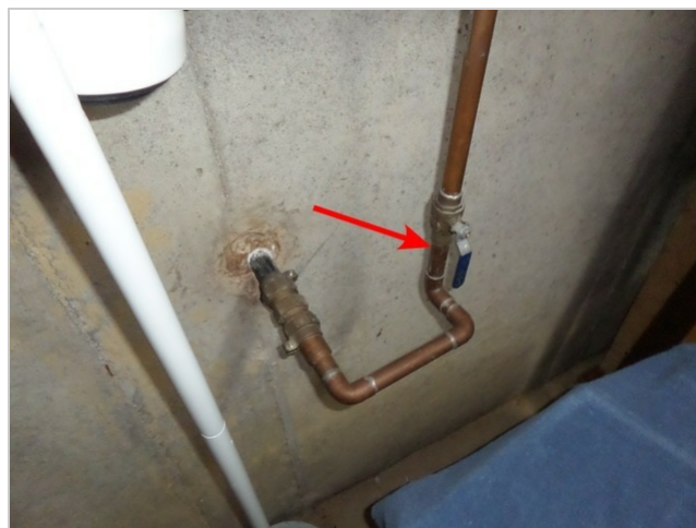
main water shut off

The water meter was located in the front yard. The main water shutoff valve for the home was located adjacent to the water service entry point in the basement.