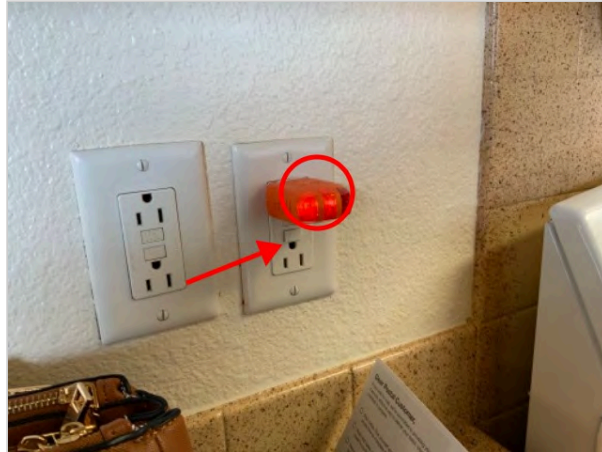
First outlet to the left of stovetop