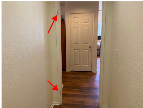
Hallway door jamb