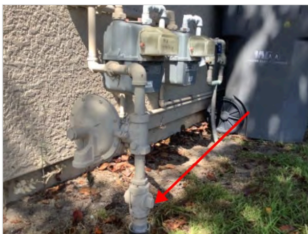
Gas main shutoff

The visible fuel supply lines throughout the structure were black steel and the condition of those lines appeared to be good. The fuel supply lines did have the proper support required. Flexible connectors were properly used to supply various gas appliances.