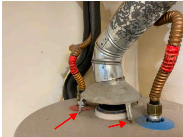
Water heater exhaust

The water heater flue pipe is not sealed properly to prevent noxious fumes from entering the structure, the flue connection should be properly sealed. Consult with a qualified plumber for repair.