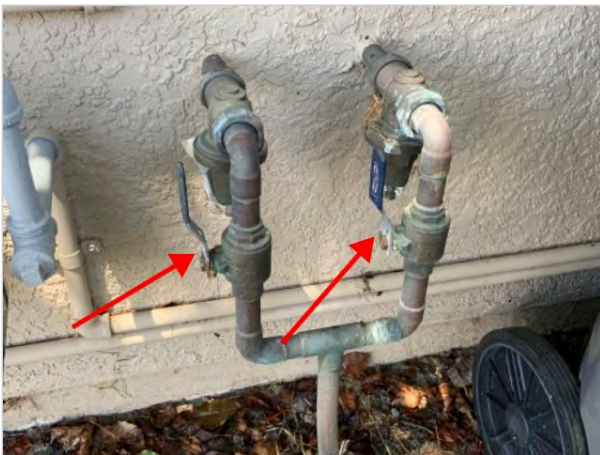
Main shut offs