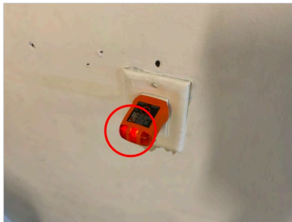
Right of garage entry door

> The GFCI outlet located in the kitchen is not functioning correctly ( will not trip) and should be repaired or replaced by a qualified electrician. GFCI breakers protect from shock in areas where water may be present and AFCI breakers protect from spark in other locations in the structure.