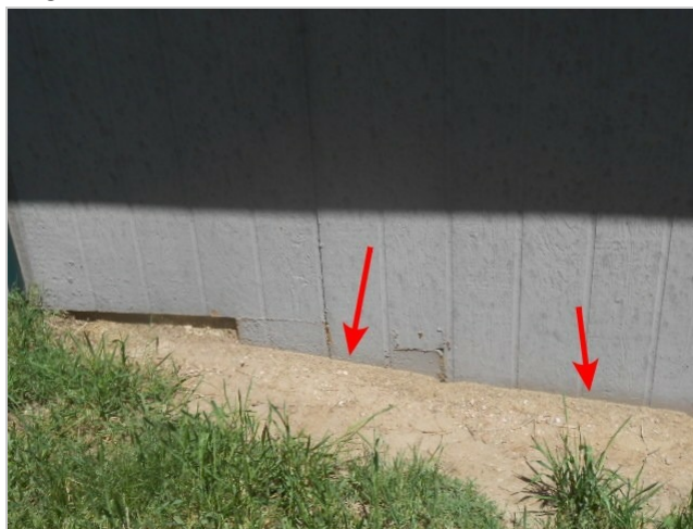
This section of siding on the rear of the home is in contact with the ground or earth.

Some of the exterior siding on the rear of the home is in contact or is under the ground or earth. This condition can lead to wood rot or insect intrusion if not corrected. Further evaluation is recommended by a qualified contractor, prior to closing.