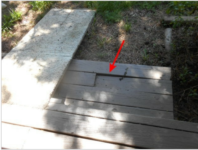
Loose or deteriorated deck board on the rear deck.