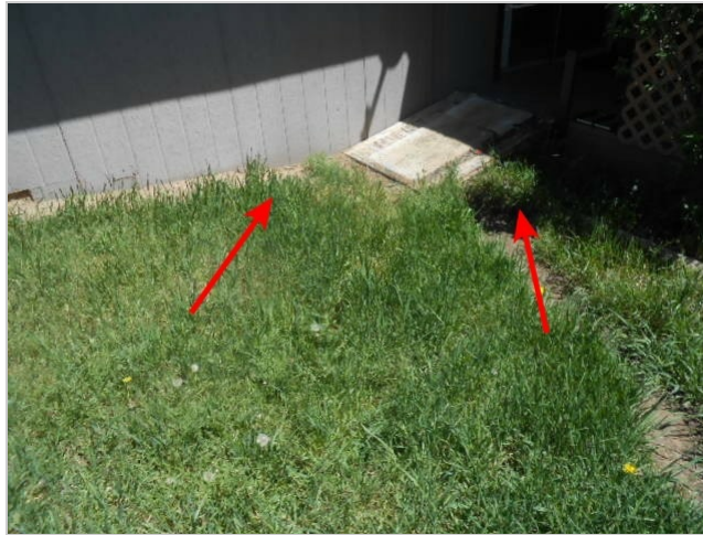
This area of exterior grading on the rear of the home is sloping towards the home.

Some of the exterior siding on the rear of the home is in contact or is under the ground or earth. This condition can lead to wood rot or insect intrusion if not corrected. Further evaluation is recommended by a qualified contractor, prior to closing.