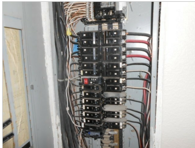
The electrical panel cover was removed for inspection of the house wiring, circuits and breakers.

The branch circuits within the panel were constructed of copper wiring. These branch circuits and the circuit breaker to which they were attached appeared to be appropriately matched. The visible house wiring consisted primarily of the Romex type and appeared to be in overall good condition.