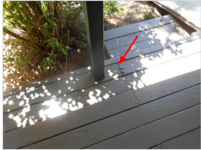
Loose or deteriorated deck boards on the rear deck.