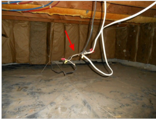
Open spliced wiring in the crawlspace.

There were a few open splices noted throughout the crawlspace at the time of inspection. Open splices consist of wires joined together outside of a junction box or loose wiring. This is a safety concern which should be corrected by a qualified electrician prior to closing.