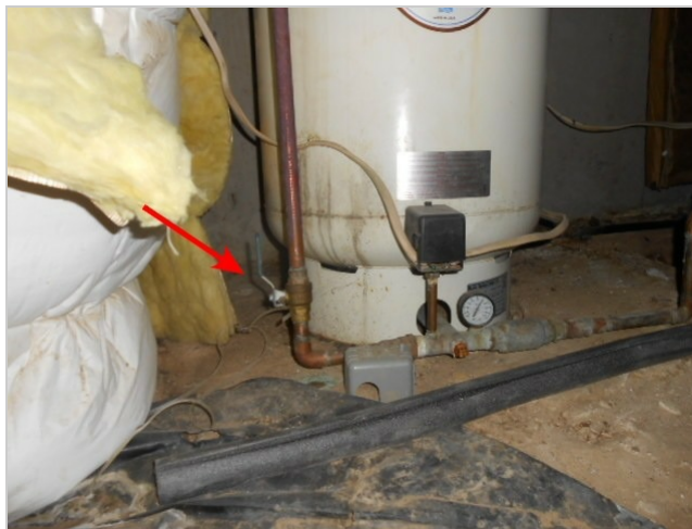
This is the main water shut off valve for the home.

The main water shutoff valve for the home was also located in the crawlspace.