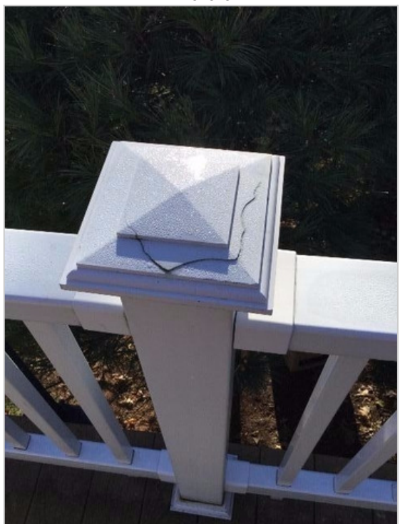
Crack in top cap of post. Non-structural - just visual impairment.