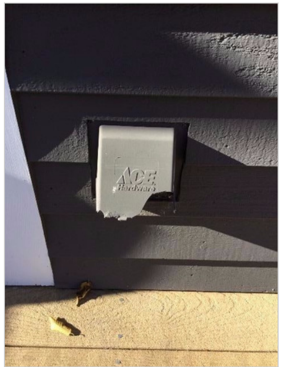
Cracked outdoor outlet cover should be replaced. Keeping moisture and water out of these outlets is important.